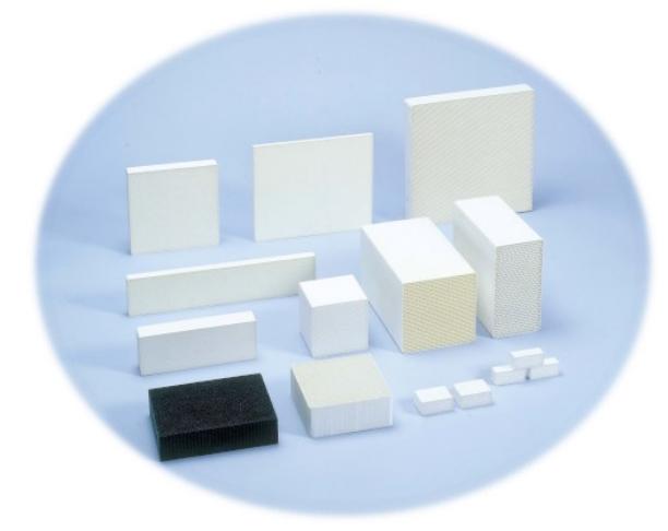
Honeycle™ filter substrates

For more information, please visit: https://www.nichias.co.jp